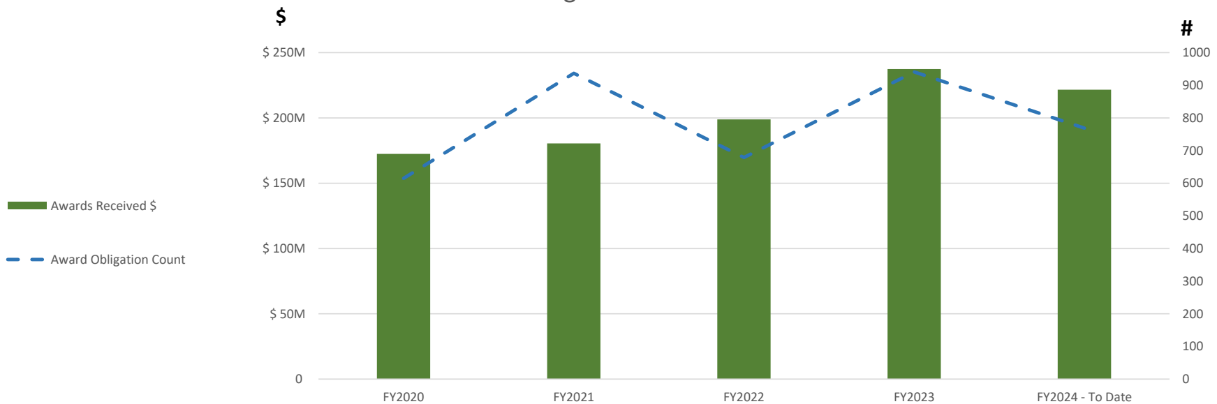
NU Award Obligations and Cumulative